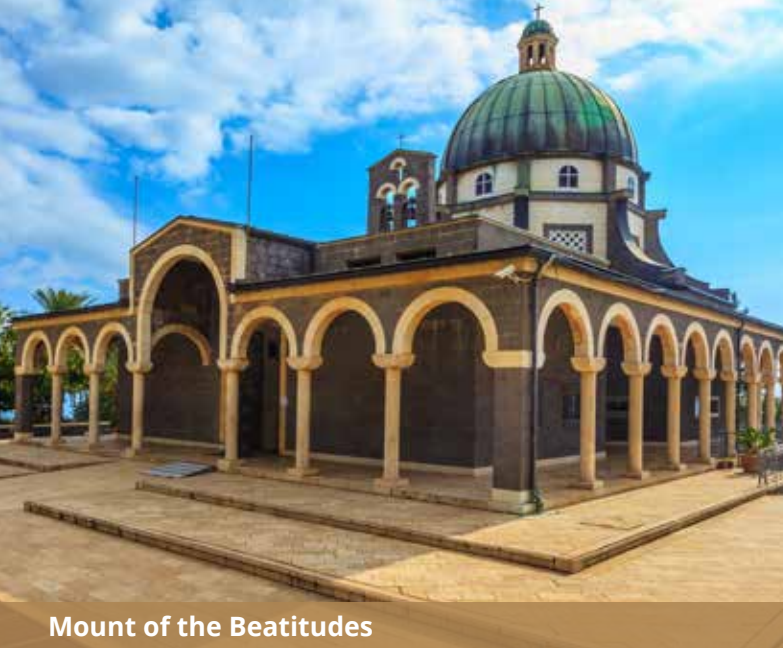
Mount of the Beatitudes