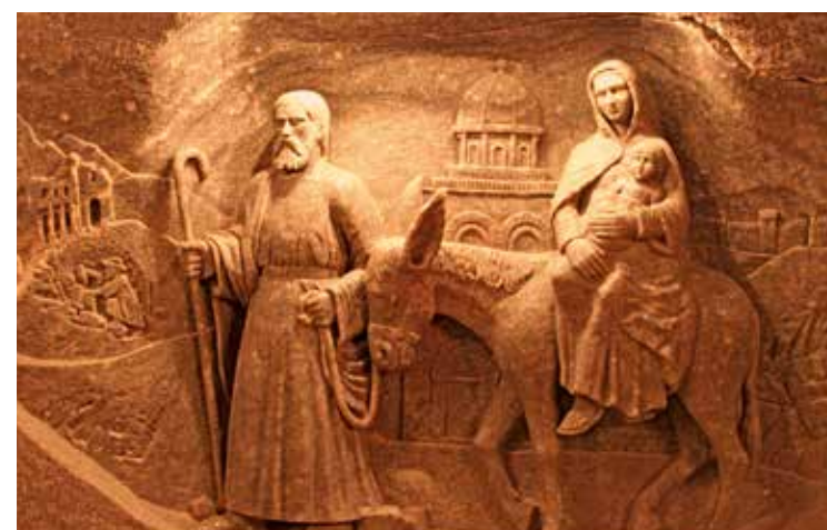
Wieliczka Salt Mines, Poland

We start the day with a visit to Cana, the village of Jesus' first miracle of changing water into wine; here couples may renew their wedding vows. Continue to the Basilica of Annunciation in Nazareth, where we will celebrate